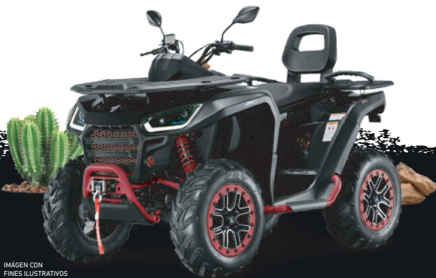
IMAGEN CON FINES ILUSTRATIVOS

RAFFLE ALONE FEATURES OVER $200,000 MXN* IN PRIZES!